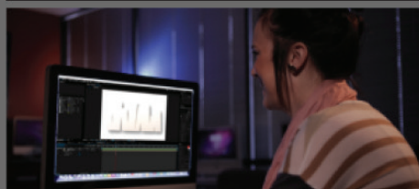
Animation & Visual Effects