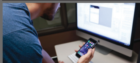
Mobile App Development