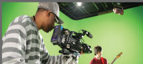
Digital Film & Video

MediaTech Institute reserves the right of course cancellation due to low enrollment.