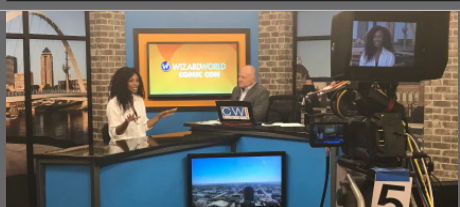
Acting for Media