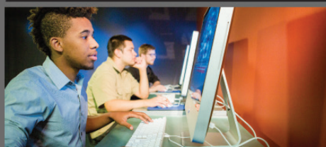
Web Design & Development